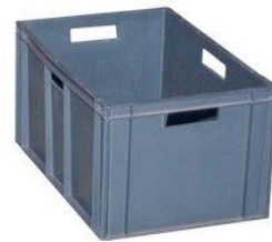
802 006 767 76.8 L bin 600 x 400 x 320 mm