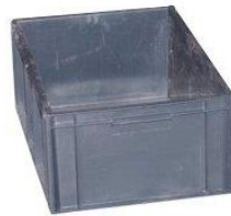
802 006 766 56.4 L bin 600 x 400 x 235 mm