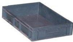
802 006 765 28.8 L bin 600 x 400 x 120 mm